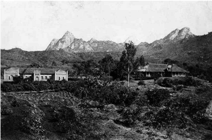
E: (Above) Mkhoma Mission station, Nyasaland and the surrounding mountains.