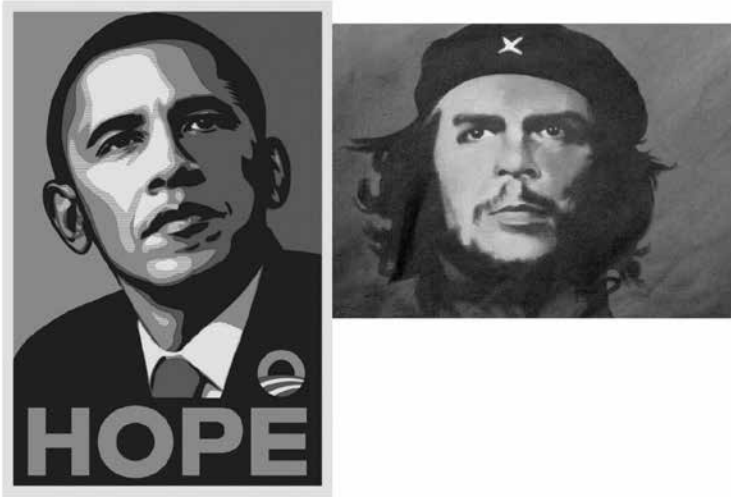
Fairey's original image, echoing this famous picture of Che Guevara